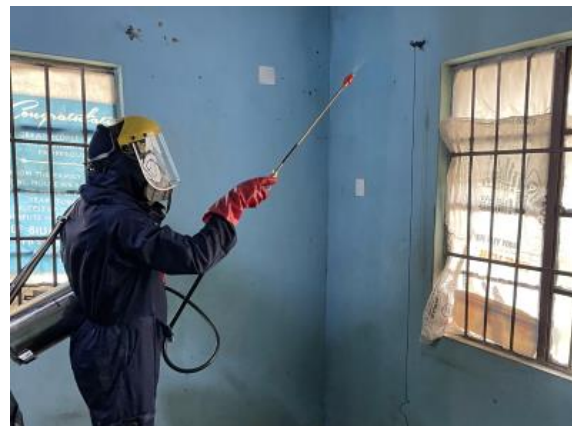
IRS village trial in Lagos, Nigeria.

VECTRON™ T500 is a new IRS product containing TENEBENAL™, the world's first meta-diamide active ingredient (IRAC Group 30) developed by Mitsui Chemicals Agro which has a different mode of action from existing vector control products.